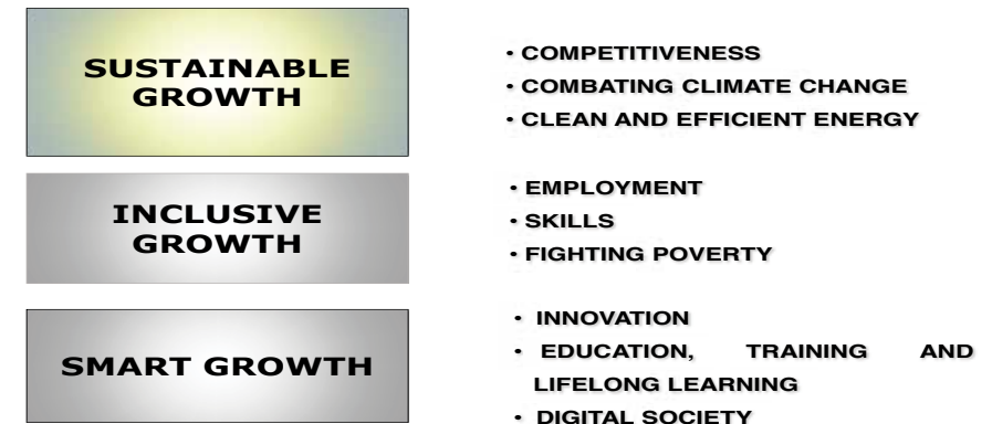
Figure 1 – EUROPE 2020 priorities

Each of three priorities implies actions in specific fields of intervention, which are illustrated in figure1.