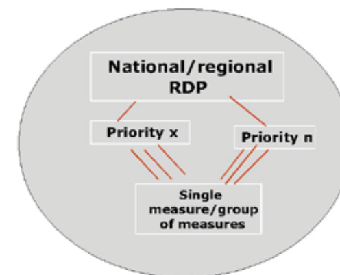
Figure 5: Create new relations between measures and priorities