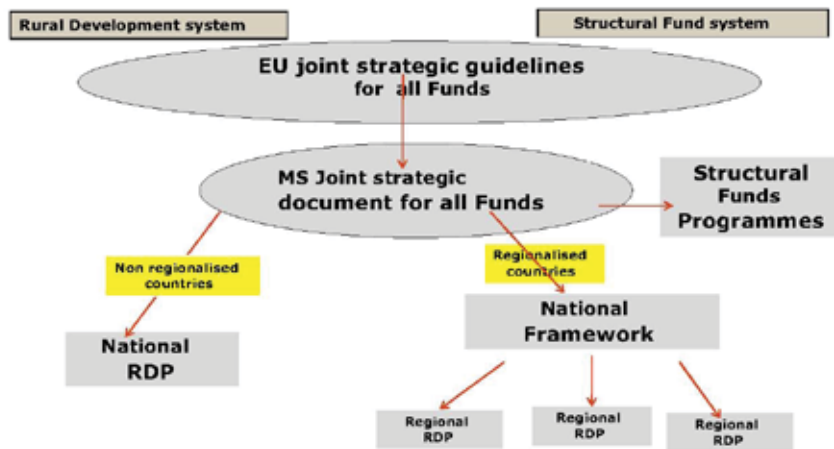
Figure 4: Proposal for a new programming system

Base the RDP on priorities instead of four axes. The rigid structure of the present axes in RDP has provoked widespread criticism for the reasons described in section 2 of this paper (see in particular sub-section 2.2). In the recent debate in informal meetings of Ministries of Agriculture, there was a plea to remove the notion of axes in favour of the concept of priorities. Further, in recent informal seminars, researchers and practitioners in the rural development field have underlined the need to remove axes and leave the room to group different measures according to their specific linkages with priority targets [Dwyer, 2010].