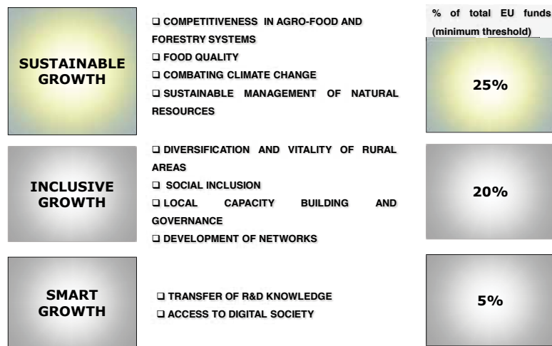
Figure 6 – Minimum thresholds for the future rural development priorities

Figure 6 indicates three minimum thresholds at the level of Europe 2020 general priorities (sustainable, inclusive and smart growth). This should be the most appropriate level for setting minimum threshold by the EC. Member States and Regions should allocate funds among the 10 common RD priorities within the Europe 2020 general priorities.