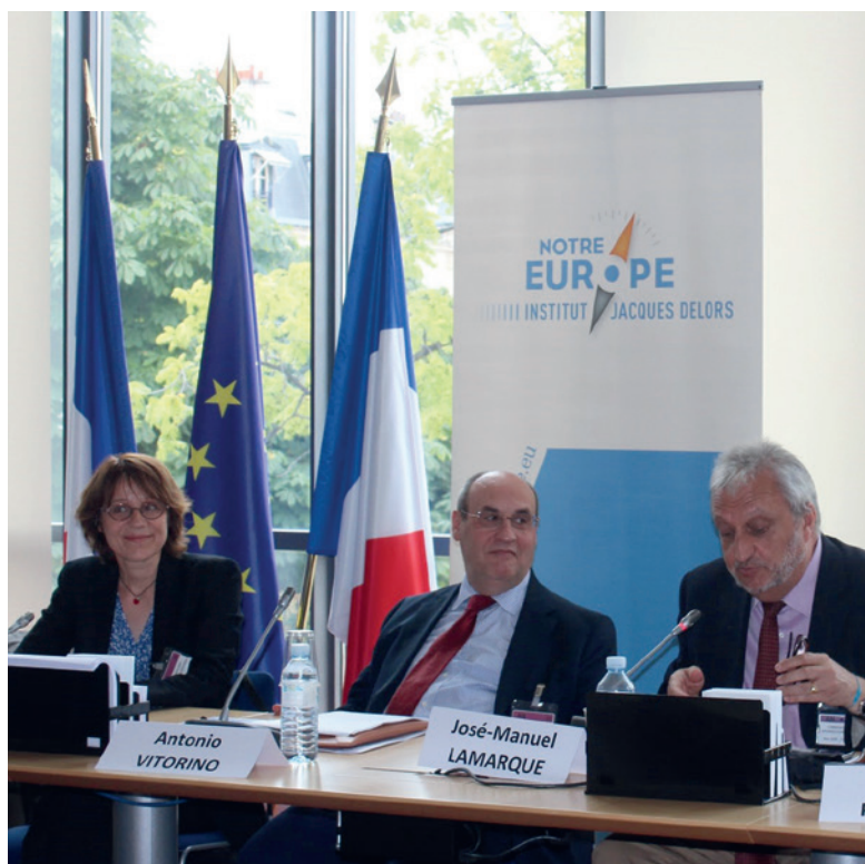
◀ Corinne Balleix, António Vitorino and José-Manuel Lamarque during the conference "The future of the European immigration and asylum policy: is the European Council up to the challenge?", organised in partnership with the EPC, Paris, 27 June 2014.