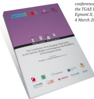
▲ International conference to present the TGAIE II Report at Egmont II, Brussels, 4 March 2010.